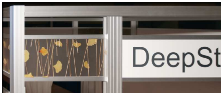
Detail of the booth structure at right