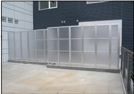
A privacy screen on a rooftop terrace.